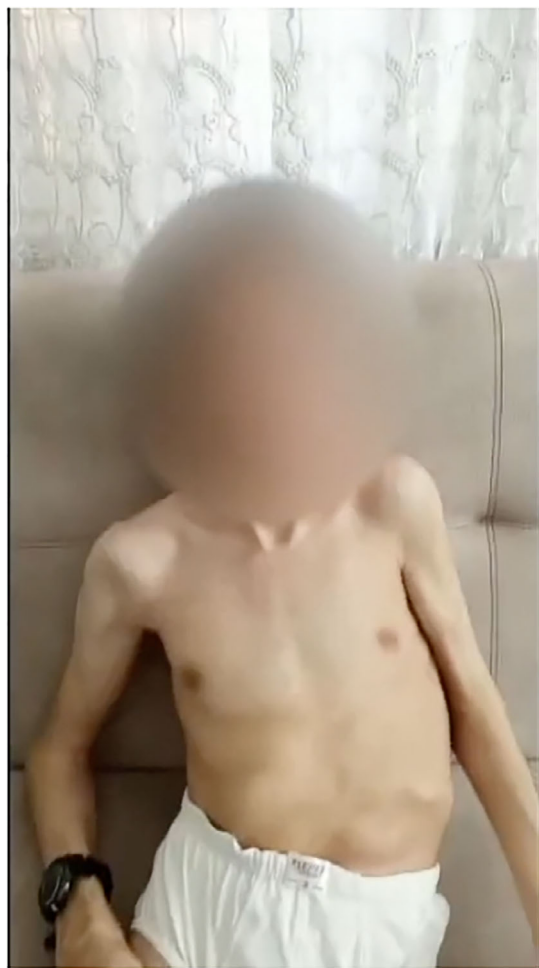
Video 1. Segment 1. Case 2 showed generalized dystonia with severe kyphoscoliosis, left hand clenching, and diffuse muscle atrophy. Segment 2. Case 2's brother (Case 3) presented with tiptoe walking on the left foot, with eversion aggravated by walking, and severe kyphoscoliosis. Segment 3. Case 4 showed kyphoscoliosis and acral dystonia with mild dystonic hand tremor. Segment 4. Case 17 (Table 1) showed tiptoe walking, which worsens with fatigue, particularly on the left. 3 Segment 5. Case 17's sister (Case 18; Table 1) showed a dystonic-spastic syndrome, mainly affecting the left hemibody. 3 Video content can be viewed at https://onlinelibrary.wiley.com/doi/10.1002/mdc3.13398

walking (Video 1). Lower-limb hyperreflexia and kyphoscoliosis were also detected. His cognitive functions were normal, and he graduated from university.