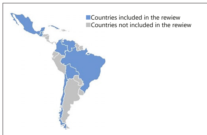
Fig. 2. Latin American countries included in studies from the literature review.