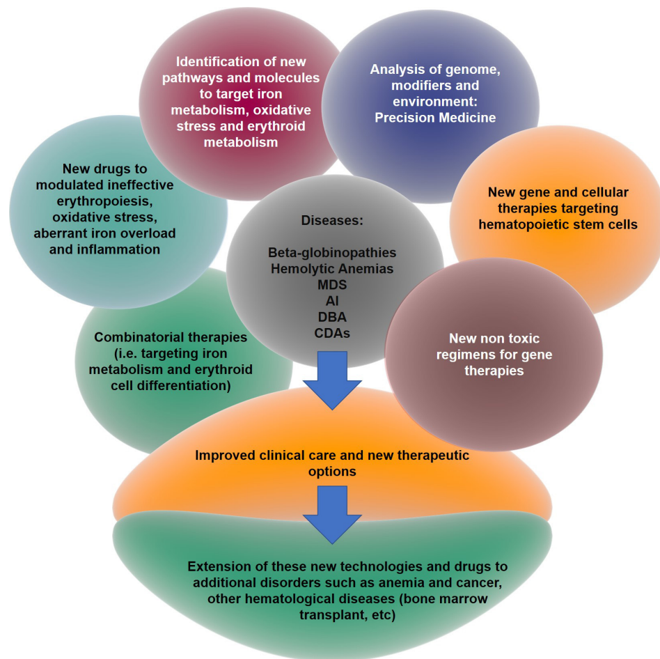
Figure 1. Graphical representations of the aims of the Research Roadmap for Anemias in Europe during the period 2020–2025.

at fast donation rates. 15 Major challenges are diagnosing ID in nonerythropoietic tissues (eg, heart, kidney, and lungs) and in the context of inflammation. It is well known that microorganisms compete with the human host for iron. An emerging issue in the field is the role of microbiota. Studies in mouse models suggest that gut microbiota might modulate iron absorption, counteracting the positive effect of duodenal HIF-2 alpha thus contributing to systemic iron homeostasis. 16