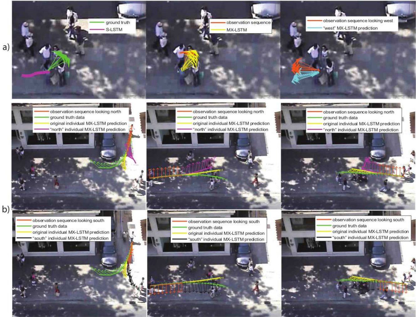
Figure 3. Qualitative results: a) MX-LSTM b) Ablation qualitative study on Individual MX-LSTM (better in color).

the second and third pictures. If the observation has the legit vislets (green arrows, barely visible since they are aligned with the trajectory), the resulting trajectory (yellow trajectory and vislets) has a different behavior, closer to the GT (green trajectory and vislets). The second row is similar, with the observation vislets made pointing to south. The prediction with the modified vislets is in black. The only difference is in the bottom left picture: here the observation vislets pointing south are in accord with the movement, so that the resulting predicted trajectory is not decelerating as in the other cases, but accelerating toward south.