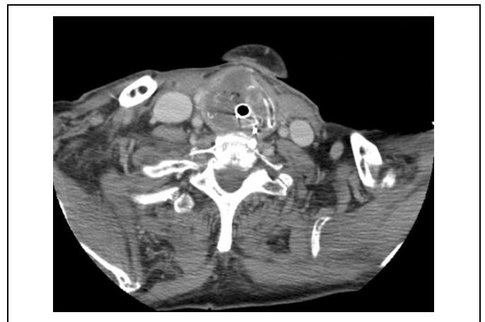
Figure 1. Computed tomography image showing an almost complete erosion of the laryngeal framework cartilages due to LLMS. Residual airway is minimal therefore an emergency oropharyngeal intubation is needed.

Debridement of the necrotic tissue and drainage of the purulent collection was performed with direct laryngoscopy. Culture was positive for Staphylococcus epidermidis and Candida albicans . Intravenous antibiotic, antimicrobial, and corticosteroid therapy was administered, and other 3 surgical debridements and drainage were performed, but without clinical or radiological improvements. Moreover, patient developed signs of sepsis. Since no improvement had been achieved, total laryngectomy was planned even without a positive histologic biopsy. Intraoperative findings showed transglottic extension of the ulcerated material with full-thickness infiltration of the laryngeal wall and external spread through the thyroid