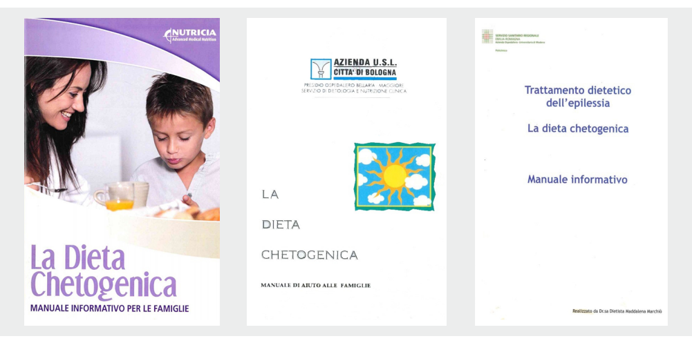
Figure 1. Paper-based informative materials on the KD offered by the centres participating in the research

All caregivers from the centres involved in the investigation were exposed to paper-based information (booklets) about the KD, whereas only the Modena group was also given access to the draft of a/the website and app, as well as to some videos of Keto-recipes created by the dieticians. In order to carry out a homogenous analysis, we decided to take into account only paper-based informative materials and to leave web-based ones to future research. To this end, the centres (see footnote 2) were asked to provide the booklets that health operators give to caregivers during doctor-caregiver encounters and we gathered the three samples in figure 1: