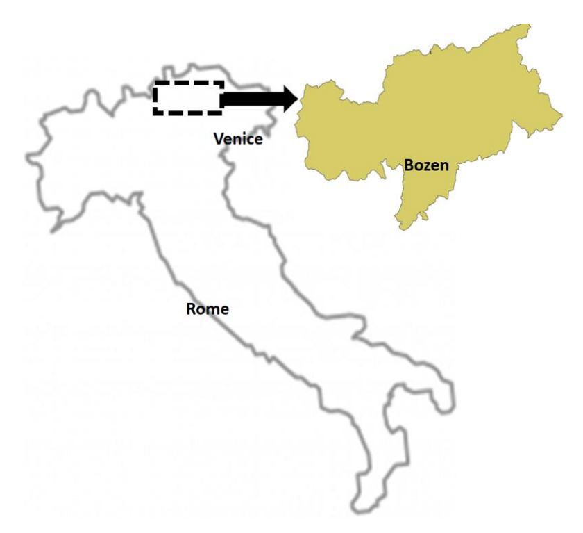
Figure 1. Italy and South-Tyrol.

Because of the German and Italian legacies, South Tyrol is an ideal and neutral setting to measure tourists' perception of sustainability of the Alpine tourism industry. Furthermore, the region is recording since years a constant tourism growth. In 2016, the number of total overnight stays was 11,679,698, or +6% with respect to the previous year (www.provincia.bz.it/astat/it/mobilita-turismo/turismo.asp).