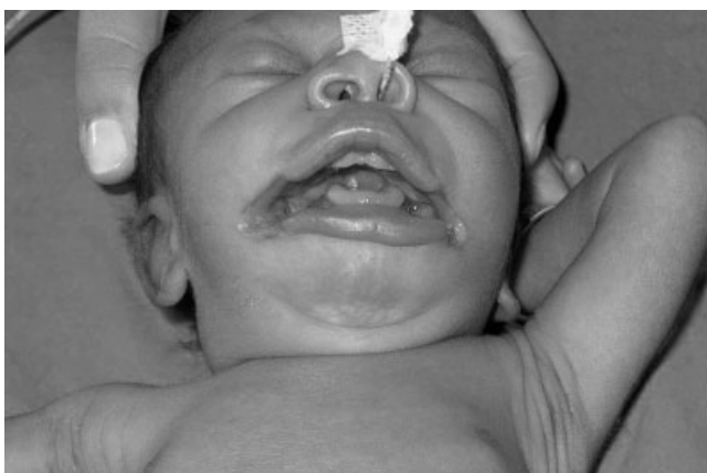
Figure 2 Appearance of the bilateral facial cleft in the newborn.

the embryonic elevating palatal shelves or to an inability of the shelves to overcome a mechanical obstruction to normal fusion 4 .