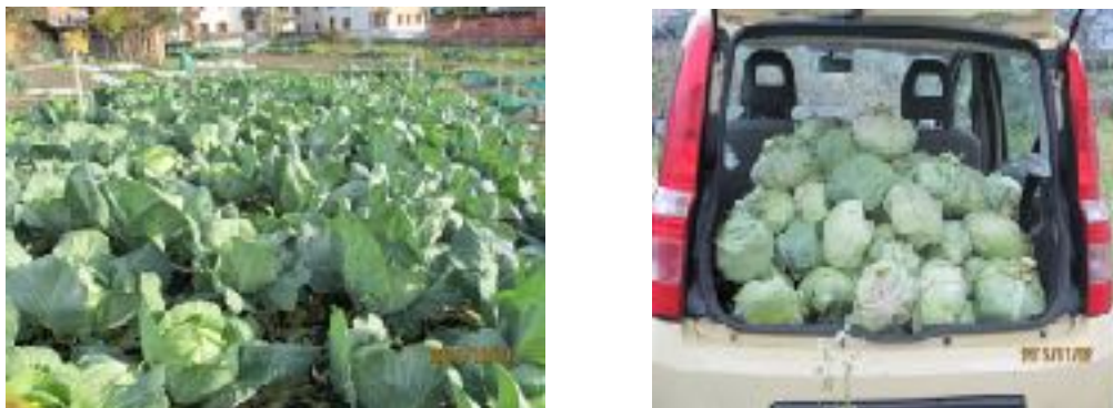
Figure 8: Cabbages ready to harvest and to be stored, November 2, 2013, (Photos © A. Paini).

The interviews were structured around a series of questions (in Italian, see Appendix) that we considered culturally appropriate/relevant, developed around six main areas, taking as a starting point the list of questions agreed upon with the other research units. The free listing tasks (30) and the semi-structured interviews (14) were recorded and later transcribed by Iolanda Da Deppo, a local research assistant from Domegge di Cadore, as we asked people to speak/respond as much as possible in their Laden dialect.