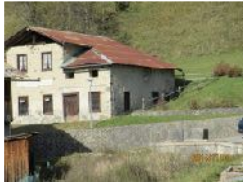
Figure 5: Communal Dairy after being cleaned and reopened for a communal evening occasion by a small group of Vinighesi, November 2014.

A social institution that cuts across this distinction is coscritti ‘an age class;’ young people, men and women, born in the same year or in nearby years. On the façade of a wooden building in via della Grotta, a prominent white graffiti “1950 51 52” written in the 1970s by the coscritti of the year 1951 has not been removed. It stands as a ‘traditional’ graffiti (see Figure 7). Seven people (men and women) of this age group still live in Vinigo (one of them only part of the year) and often emphasize this sense of belonging: they still engage in communal activities. It was their idea to clean the inside of the Communal Dairy in the spring/summer of 2014 as a part of a project for a new cultural association.