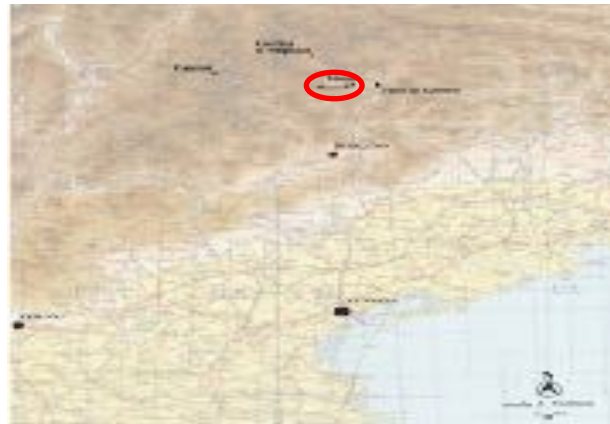
Figure 1: The Fieldsite: Vinigo in the Veneto Dolomites

life of the people of Vinigo and in their daily talk they often make reference to them. To the south lies Mt. Rite (2,160 m). and to the east Col Maò (1,470 m).