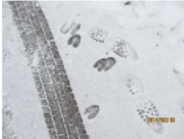
Figure 9: Vinigo after the snow storm: Footprints, animal tracks, and tire tracks, February 10, 2014

similar remark: 'In the past the boundaries between fields, you could see them, really you could see them.' So the change in the environment has brought along also a change in the ability to recall, the knowledge of boundaries is lost.