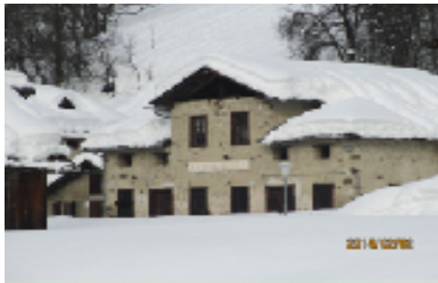
Figure 4: Communal Dairy, February 2014