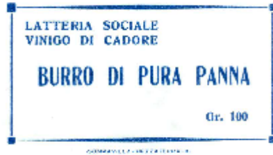
Figure 3: Stamp of the Communal Dairy (from letterhead)

from Festin: The Church of Saint John is located in the Festin half, whereas the Chapel of Saint Lorenzo in the Savilla half. Another line indicates the road descending to Peaio.