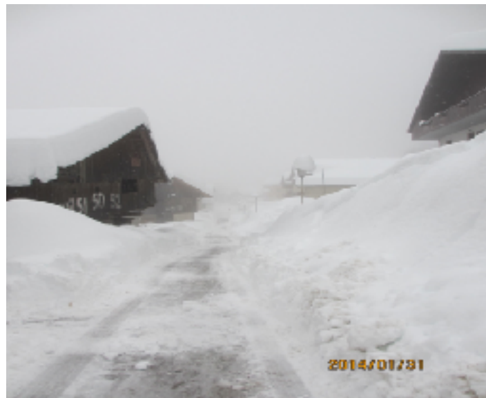
Figure 7: Via alla Grotta, Graffiti, January 2014

In the past, Vinighesi kept capuze they cultivated in the pias for consuming at home and exchanged some of them with people from other communities. Today,