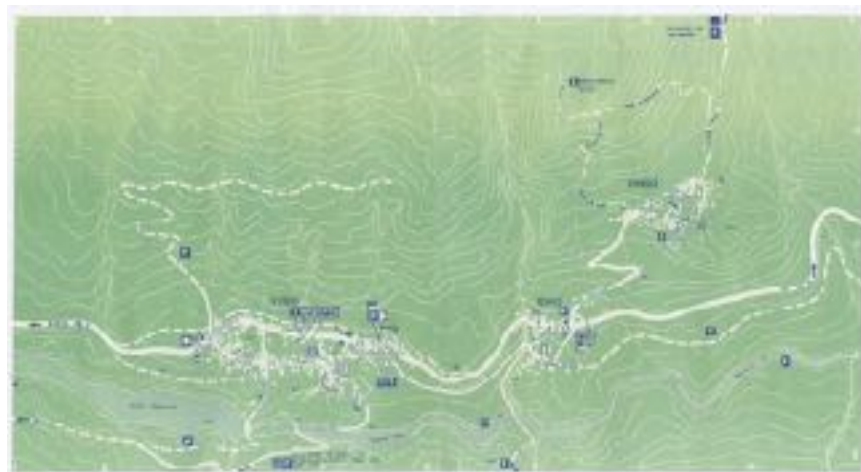
Figure 2: Vodo (Municipality) and Peaio (route SS51) and the village of Vinigo

The relationship between Vinigo and Vodo has not been an easy one. To stress this tension our interlocutors often made reference to the nicknames used to refer to the inhabitants of each village of the area. Vinighesi are called “ i cian de Vinigo ” ‘dogs from Vinigo.’ Local people explain that it refers to the high altitude of Vinigo and the role of guardians of the territory historically played by its inhabitants. Vodesi are instead called “cats” (De Ghetto 2009: 48).