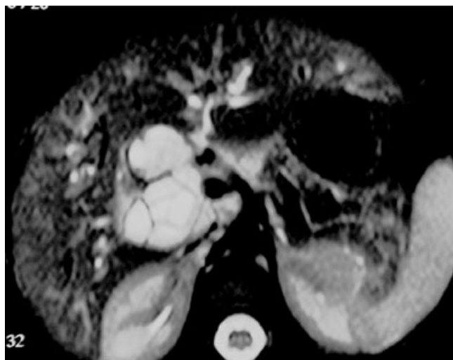
Figure 1. Abdominal MRI at the level of the hepatic hilum. MRI, magnetic resonance imaging.