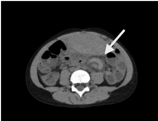
Figure 1. Computed tomography scan showing the spleen in the pelvis. The whirl sign (arrow) indicates torsion of the vascular pedicle.