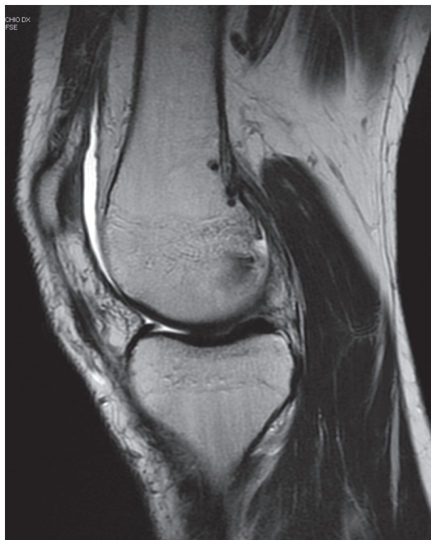
Figure 1. MRI T2 image shows the extremely posterior position of femoral tunnels

The RigidFix Cross Pin System (Depuy Mitek) places two bioabsorbable pins across the femur traversing the femoral tunnel for secure femoral fixation of the graft tissue working as transverse suspension bar perpendicular to pullout forces (6,7).