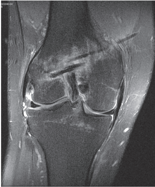
Figure 2. MRI STIR image shows the pin in soft tissues over the proximal femoral pin's tunnel