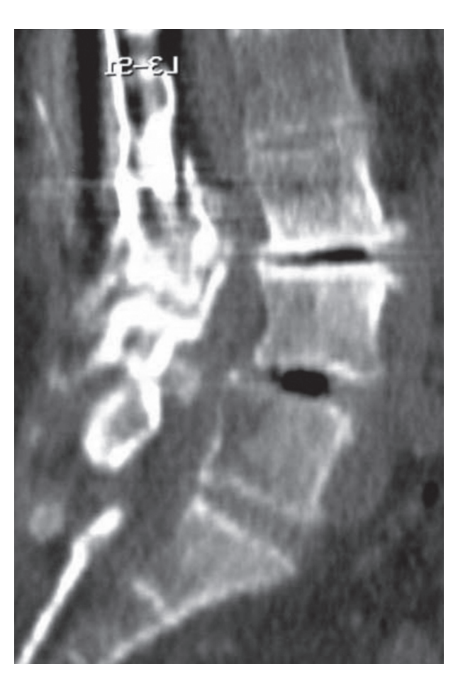
Figure 4. Case 2. CT. Stenosis with degenerative spondylolisthesis of L4-L5

If revision surgery for FBSS is technically challenging and may be associated with high risk of com-