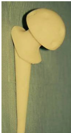
FIGURE 2: Image of the preformed gentamicin-loaded cement spacer after surgical addition of vancomycin using the “surface drill hole” technique.

MIC 90 = 8.0 mg/L, and resistance to vancomycin by MIC 90 > 4.0 mg/L for the strains tested. Synergy testing was performed in duplicate using the checkerboard method in microtiter plates with Mueller-Hinton Broth (MHB, Difco). Gentamicin and vancomycin were diluted in MHB and tested at different twofold concentrations (from 0.3 to 20.0 mg/L) against all strains (final inoculum 1 × 10 5 CFU/mL). The fractional inhibitory concentration index (FICI) was calculated and interpreted for each strain [22]: the FICI was defined as synergistic if the values were <0.5, indifferent or additive if the values were from 0.5 to 4.0, and antagonistic if the values were >4.0 [23] (Table 1).