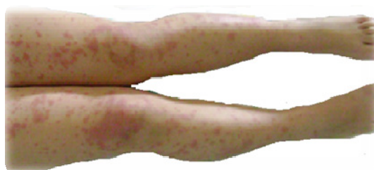
Fig. 1. Henoch-Schönlein purpura in a 8 years old female child

The purpura typically appears on the legs and buttocks (Fig.1), but may also be seen on the arms, face and trunk. The abdominal pain is colicky, and may be accompanied by nausea, vomiting, constipation or diarrhea. There may be blood or mucus in the stools. Sometime finding includes a gastrointestinal haemorrhage, occurring in 33% of cases, due to intussusceptions (Saulsbury, 1999). The joints involved tend to be the ankles, knees, and elbows but arthritis in the hands and feet is possible; the arthritis is non-erosive and hence causes no permanent deformity. Problems in other organs, such as the central nervous system (brain and spinal cord) and lungs may occur, but much less commonly than the skin, bowel and kidneys (Saulsbury, 2001)