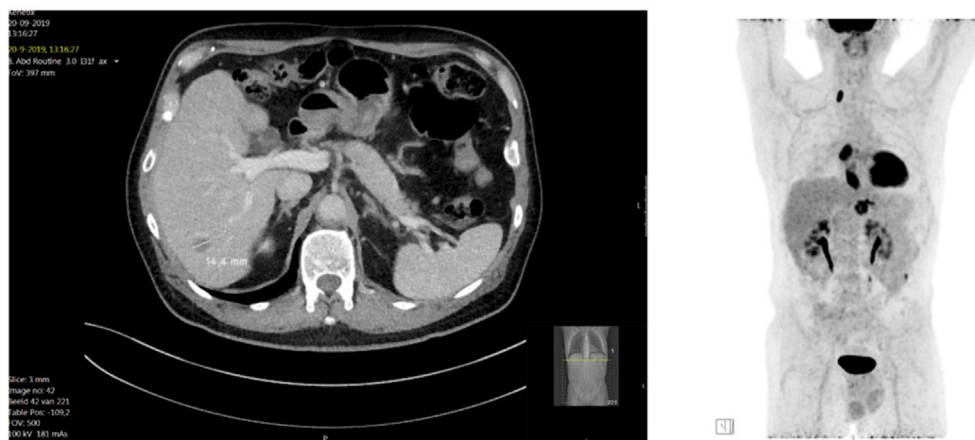
Fig. 2. Follow-up information of real-life clinical case #3 included in this survey.

oncologist, and radiation oncologist, the following specialities were present at the MDT meetings: a radiologist in 60%, a gastroenterologist in 49%, a pathologist in 40%, and a nuclear medicine physician in 28%. Table 2 shows the characteristics of the participating MDTs.