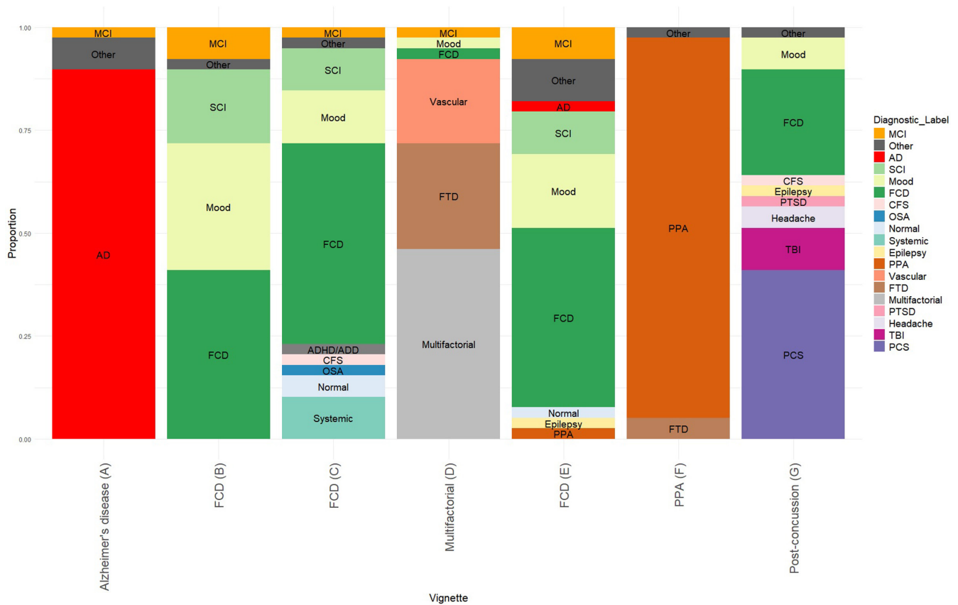
FIGURE 2 Diagnostic labels for each clinical scenario. Research study reference diagnoses are named under each bar. AD, Alzheimer's disease; CFS, chronic fatigue syndrome; FCD, functional cognitive disorder; FTD, frontotemporal dementia; MCI, mild cognitive impairment; OSA, obstructive sleep apnea; PCS, 'post-concussion syndrome'; PPA, primary progressive aphasia; PTSD, post-traumatic stress disorder; SCI, subjective cognitive impairment; TBI, traumatic brain injury.

for FCD was 3–4, with blood tests, MRI scan and neuropsychological evaluation leading the preferences. Neurologists were more likely to ask for a CSF study ( p < 0.001 ), but not other tests, in comparison with non-neurologists.