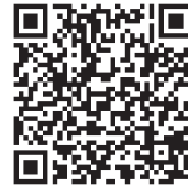
Figure 1.1 QR code referring to interactive exercises.

Access interactive exercises for this chapter 1 by positioning your smartphone camera at the dot-filled box, also known as a QR code.