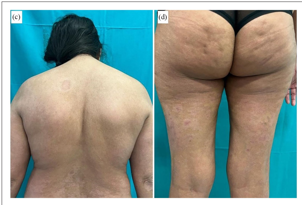
Figure 2. At 2 weeks after the first spesolimab dose, complete clearance of the erythematous plaques and pustules on the back (a) and on the limbs (b); some post-inflammatory sequelae persist.

patient also reported severe skin pain with a Numerical Rating Scale for Pain (pain NRS)=9/10. Some typical psoriasis plaques were also present on the trunk and lower limbs (PASI 6). In November 2022, spesolimab 900 mg was