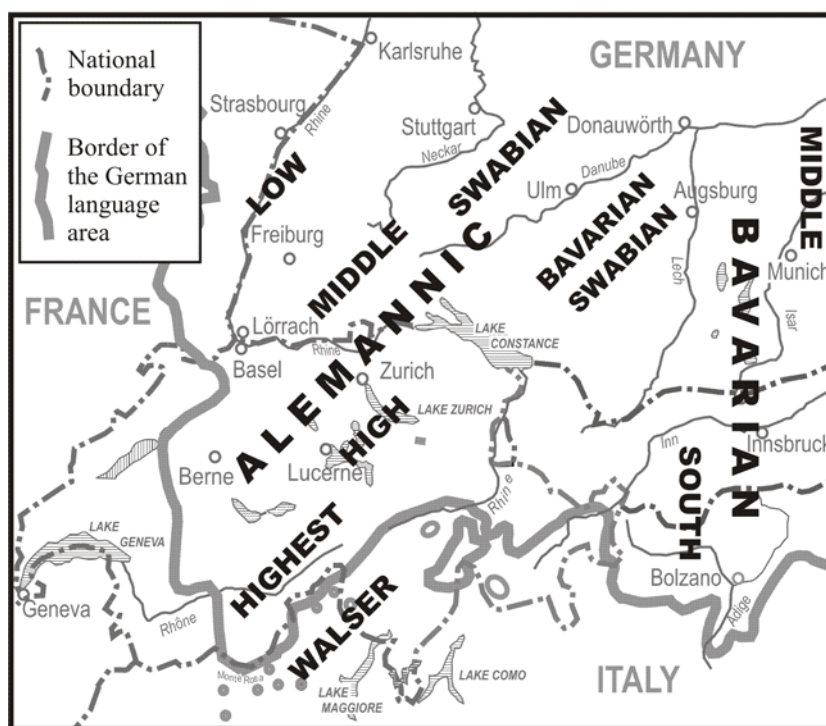
Map 1: Extents of Alemannic dialects.

marker for the second person. The southern Highest Alemannic dialects including the Walser language islands have usually conserved the Middle High German three-form plural. Table 1 below gives examples of the different plural types, whose allomorphic realization depends on verb class and dialect area. 6