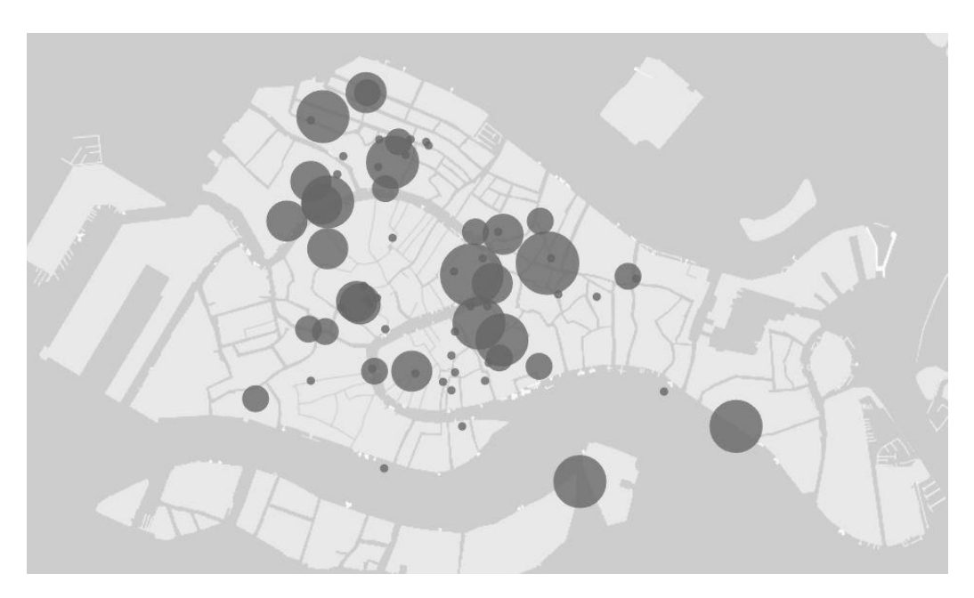
Figure 2. Map of the main places mentioned in Inquisition records for the period of the 1540s–1580s. The size of the circles indicates the extent of activities discovered in those locations.

which worked at the Ruga de Oresi was also active. Forbidden books were hidden and secretly exchanged in their shops—in particular, we can mention the one of Giulio da Stan, where Panarelli received a copy of the Benefit of Christ Crucified .